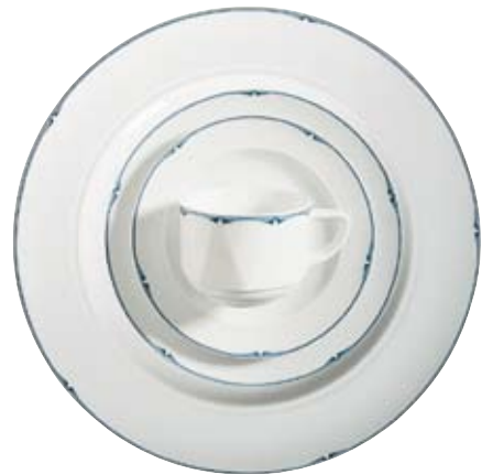
409520 Piccolo Blau