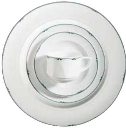
409230 Piccola Lagerdekor, Stock decoration, Décoration de stock, Decorado de stock, Decoro su articoli in magazzino