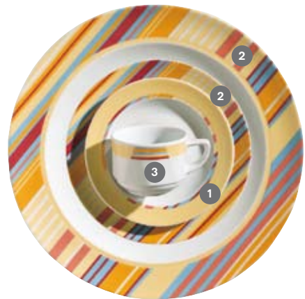
1 418280 Toccata Fond 2 418290 Toccata Streifen 3 418300 Toccata