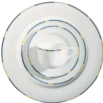
409500 Combo Blau